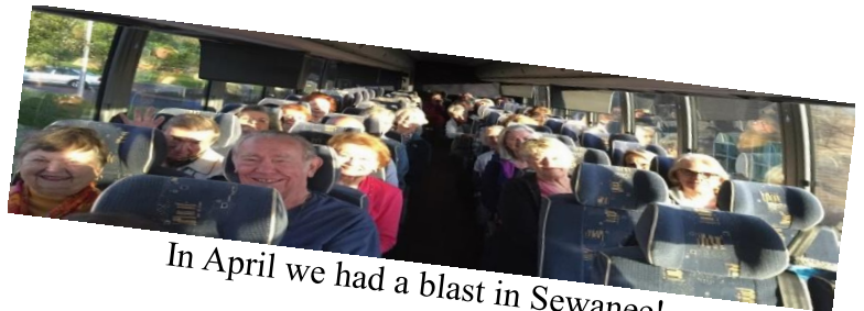
In April we had a blast in Sewanee!

For more info on this and future trips pick up a flyer at the front desk!